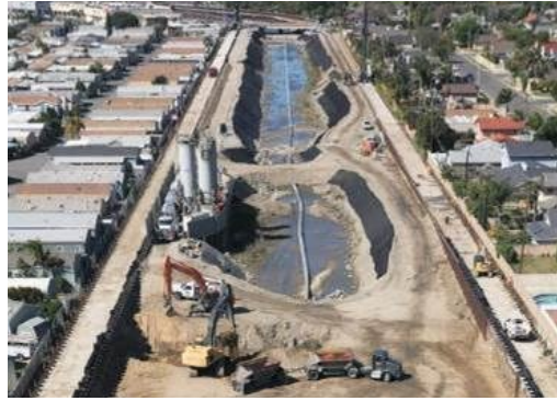
The Cement Mixing Silos pictured here (left side of channel) will be demobilized by June 2022.

Keep a lookout for our construction teams working on Deep Soil Cement Mixing, Channel Slope Excavation, Concrete Cap, and Drainage Best Management Practices (BMPs).