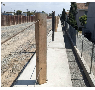
Road improvements, Concrete Cap, Landside Drainage BMP, and Right-of-Way Fencing.